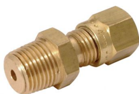
MALE STUD COUPLING

When used on air or gas, a further factor of safety should be added.