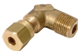
MALE STUD ELBOW